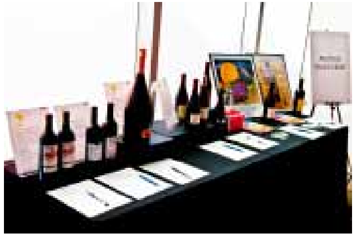
Taste for Art Wine Auction Table.

O n Friday, August 20th, the Nevada Museum of Art hosted the 26th Annual Taste for Art. This year's fund-raiser was a tremendous success raising over $76,000 to benefit the Museum's Education and Exhibition programs.