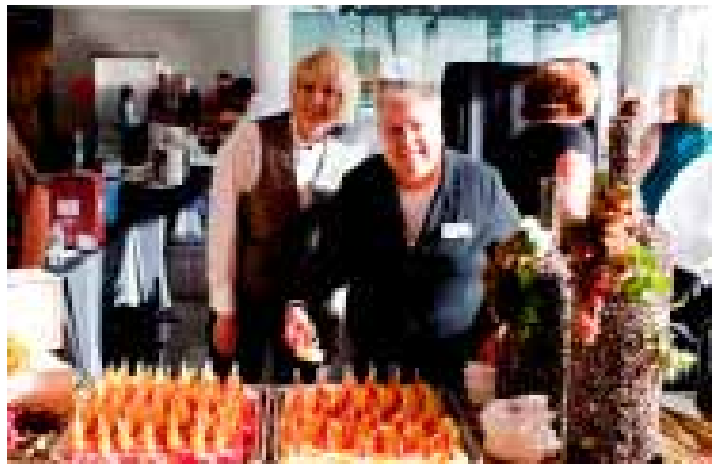
Caterers offer tasty treats to compliment wine tasting.